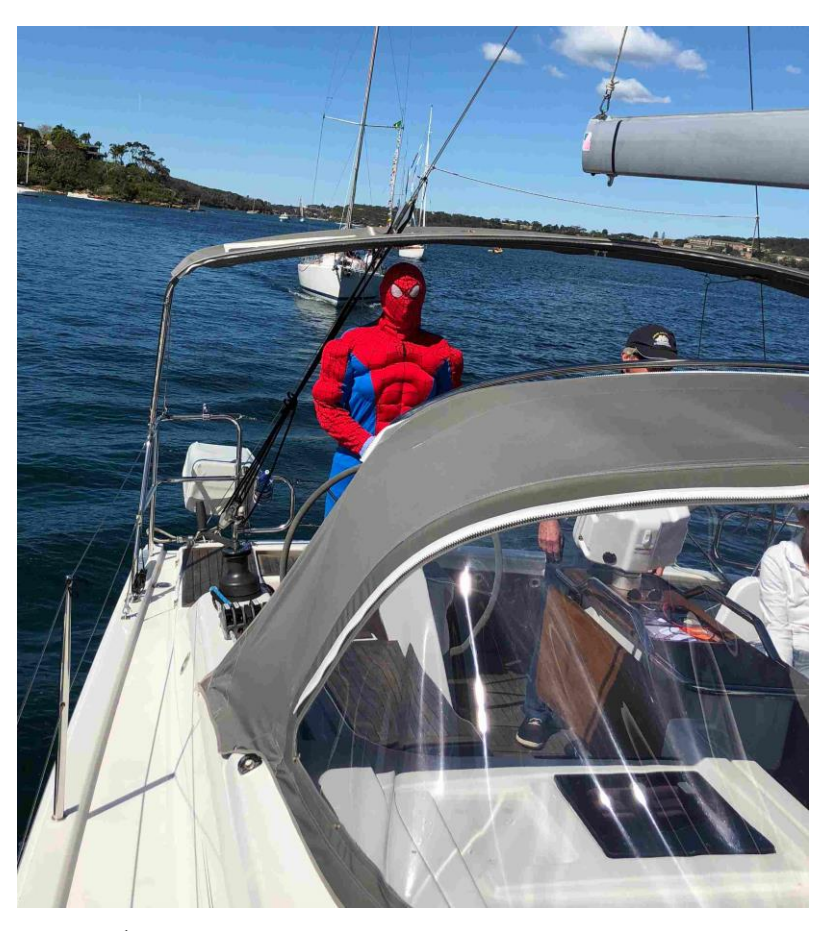
{f 1} - Spiderman aka. Dallas at the help of La Madre

What a beautiful day mother nature turned on for the MHYC opening day. With blue skies and a high of 21 degrees' no one dare complain as the days on either side of Saturday were raining and cold.